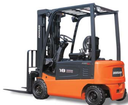
B16X / B18X / B20X - 5 Capacity Range 1,600 - 2,000kg 4 Wheel