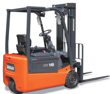
B15T / B18T / B20T - 5 Capacity Range 1,500 - 2,000kg 3 Wheel